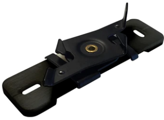
Fixed ceiling kit. 2 unit kit 08.8866.14