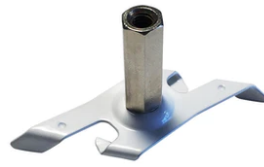
Adjustable ceiling kit. 2 unit kit 08.8867.14