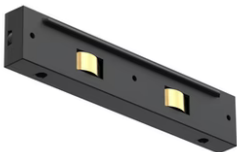
Recessed/Surface Intermediate Connector 06.6035.14