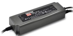
24V Remote power supply. Dimmable through DALI protocol. 120W 110/240V