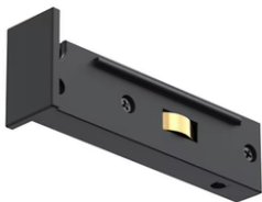
Recessed/Surface Feed Connector 06.6034.14