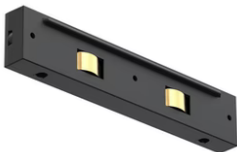
Recessed/Surface Intermediate Connector 06.6035.14