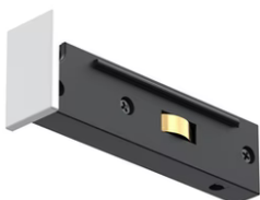
Recessed/Surface Feed Connector 06.6034.40