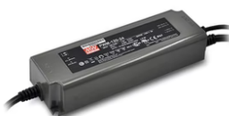
24V Remote power supply. Dimmable through DALI protocol. 120W 110/240V 60.9682