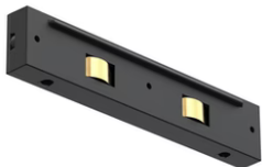
Recessed/Surface Intermediate Connector 06.6035.14