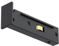
Recessed/Surface Feed Connector 06.6034.14