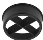
Screening crosspiece 08.8429.00