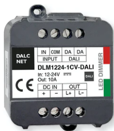
0-10V, 1-10V, DALI and PUSH interface 60.9391