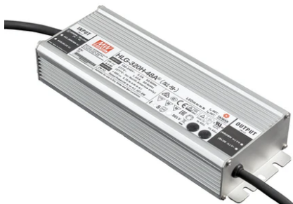
LED Power Supply Source for remote installation. 48V/320W. 100/240 Vac 60.8919