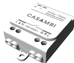
Casambi Controller 220-240V. Remote Installation 60.9392