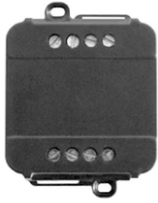
0/1-10V & Push 12-48V Dimmer 60.9395