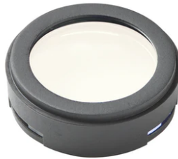
Elliptical lens 08.8627.68