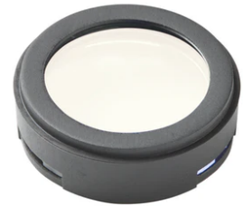
Flood lens 08.3310.19