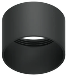
Screening external ring for Running Magnet spot module 08.8427.14