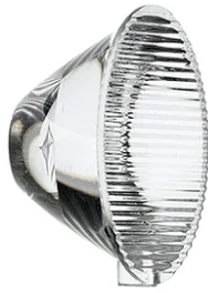
Elliptical Lens 08.8759.00