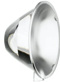
Frosted Medium lens 08.8760.00