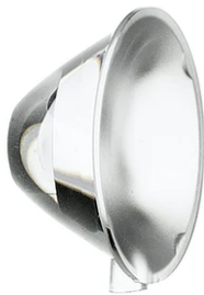
Frosted Flood lens 08.8761.00