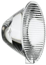
Elliptical Lens 08.8759.00