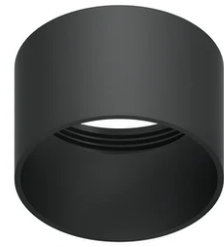
Screening external ring for Running Magnet spot module 08.8427.14