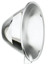
Frosted Medium lens 08.8760.00