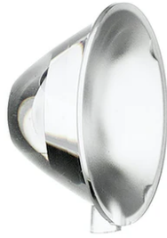
Frosted Flood lens 08.8761.00