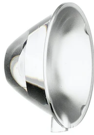
Frosted Flood lens 08.8761.00