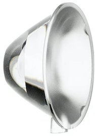
Frosted Medium lens 08.8760.00