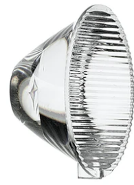
Elliptical Lens 08.8759.00