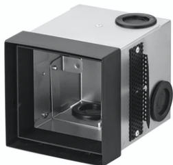
Flush wall Installation 08.8246.00