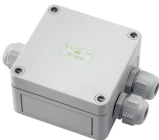
Junction box 08.8012.00