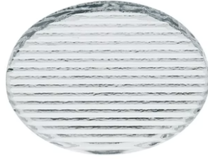
Elliptical light distribution lens 08.8041.68