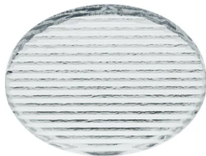
Elliptical light distribution lens 08.8041.68