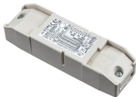
Continuous current power supply of