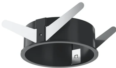
Installation Frame Trim 08.0161.14