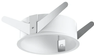
Installation Frame Trim 08.0161.40