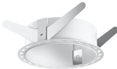
Installation Frame No Trim 08.0163.00