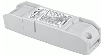
Continuous current power supply, 0/1-10V dimmable, 220/240V – 50/60Hz, 36W – 700 mA 60.9439