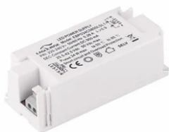
Power supply non dimmable. 24WNon dimmable continuous current power supply of 24W, 110/277V – 50/60Hz, with power current selected through adjustable 600 mA switch 60.9523