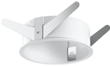
Installation Frame Trim 08.0161.40