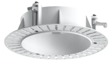
Installation Frame No Trim 08.0193.00