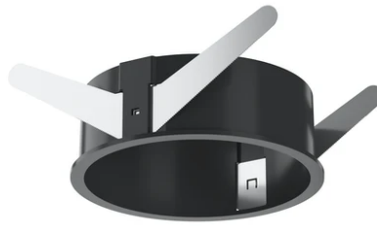
Installation Frame Trim 08.0161.14