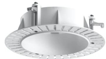
Installation Frame No Trim 08.0193.00