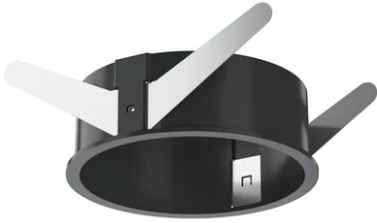
Installation Frame Trim 08.0161.14