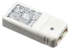
Continuous current power supply of 12-20W, 110/240V – 50/60Hz with power current selected through adjustable 350mA – 17W / 400mA – 19W / 450 / 550 / 600 / 700mA – 20W regulable Dali 1 y Dali 2 60.9222