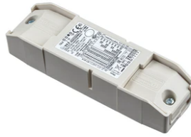
Continuous current power supply 220/240V – 50/60Hz. Adjustable Current 300mA-13W / 350mA-15W / 400mA-18W / 450mA-20W / 500mA-22W / 550mA- 24W / 600mA-27W / 650mA-29W / 700mA-31W / 750mA-32W / 800mA-33W / 850mA-35W / 900mA-38W / 950mA- 40W / 1000/1050mA-42W 60.9162