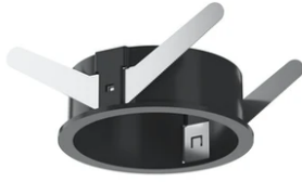
Installation Frame Trim 08.0160.14