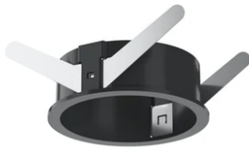
Installation Frame Trim 08.0164.14