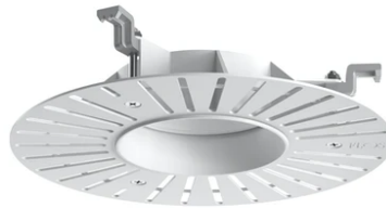
Installation Frame No Trim 08.0166.00