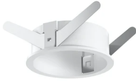
Installation Frame Trim 08.0164.40