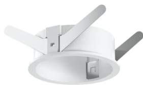
Installation Frame Trim 08.0164.40