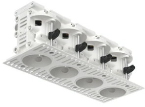
Pre-installation frame. 4L – int 43 08.0582.00