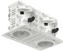
Pre-installation frame. 2L – int 70 08.0583.00