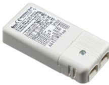
Non dimmable continuous current power supply of 15-20W, 110/240V – 50/60Hz, with power current selected through adjustable 350 mA-15W /500 mA/ /550 / 700 / 850 mA / 900 mA – 20W switch 60.8911