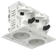
Pre-installation frame. 2L – int 43 08.0581.00