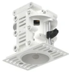
Pre-installation frame. 1L 08.0580.00