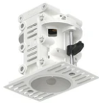
Pre-installation frame. 1L 08.0580.00