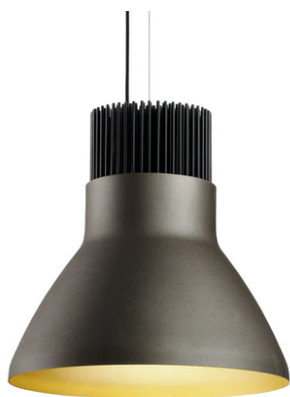
Light Bell 07.9630.18