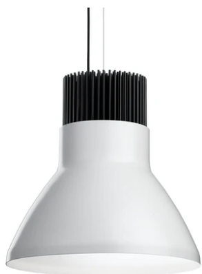
Light Bell 07.9630.70