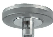
Rosette for indoors. IP20. Dimmable Push/Dali F0557020