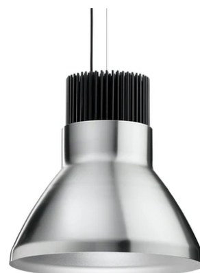
Light Bell 07.9630.AP