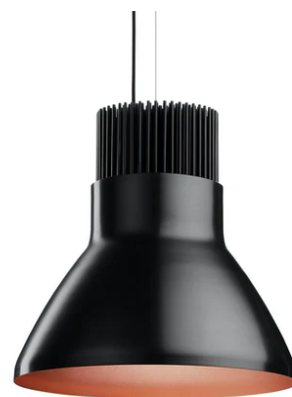
Light Bell 07.9630.7C