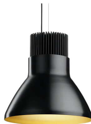
Light Bell 07.9630.AN