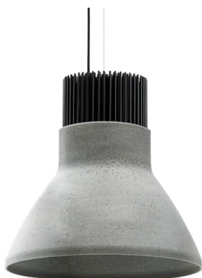
Light Bell 07.9630.CE