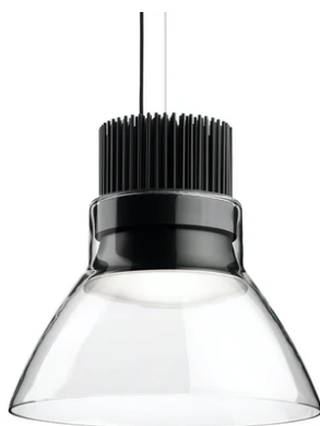
Light Bell 07.9630.76