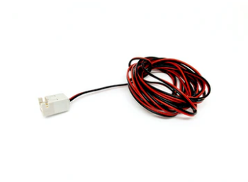
Feed cable 2500 mm 06.0097.00