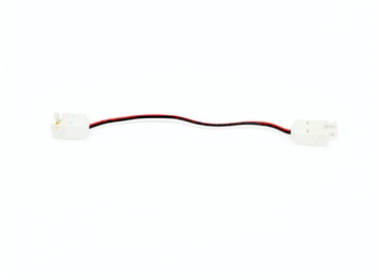
Connection cable 150 mm 06.0098.00