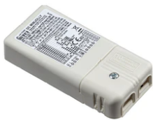
Continuous current power supply of 13-20W, 110*/240V – 50/60Hz with power current selected through adjustable switch. 1-10V or push dimming. 60.9188