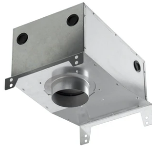
Installation can for concrete 08.8420.00