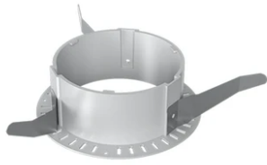
Installation frame No Trim 08.9104.00