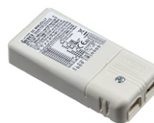
Continuous current power supply of 13-20W, 110*/240V – 50/60Hz with power current selected through adjustable switch. 1-10V or push dimming. 60.9188