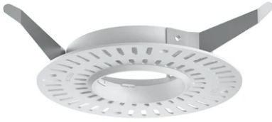
Installation frame No Trim 08.9114.00