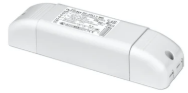
Continuous current power supply. 220/240V – 50/60Hz. Adjustable Current 150 mA – 7,2W / 200 mA – 9,5W / 250 mA – 12W / 300 mA -14,5W / 350 mA -17W/400 mA – 19,5W / 450 mA -21,5W /500 mA – 24W. Mains or push dimming 60.9421