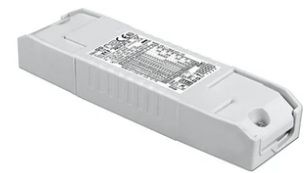
Non dimmable continuous current power supply of 220/240V – 50/60Hz with power current selected through adjustable with switch 200 mA – 8,5W / 300 mA – 13W / 350 mA – 15W / 400 mA – 17,5W / 450 mA – 19,5W / 500 mA – 22W 60.9160