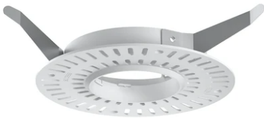
Installation frame No Trim 08.9114.00