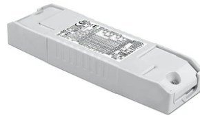
Non dimmable continuous current power supply of 220/240V – 50/60Hz with power current selected through adjustable with switch 200 mA – 8,5W / 300 mA – 13W / 350 mA – 15W / 400 mA – 17,5W / 450 mA – 19,5W / 500 mA – 22W 60.9160