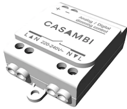
Casambi Controller 220-240V. Remote Installation 60.9392