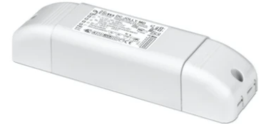
Continuous current power supply. 220/240V – 50/60Hz. Adjustable Current 150 mA – 7,2W / 200 mA – 9,5W / 250 mA – 12W / 300 mA -14,5W / 350 mA -17W/400 mA – 19,5W /450 mA -21,5W /500 mA – 24W. Mains or push dimming 60.9421