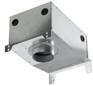
Installation can for concrete 08.8420.00