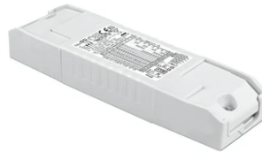
Non dimmable continuous current power supply. 15-30W, 220/240V -50/60Hz with power currents selected through adjustable switch. 350mA – 15W / 400mA – 17W / 450mA – 19W / 500mA – 22W / 550mA – 24W / 600mA – 26W / 650mA – 28W / 700mA – 30W no regulable 60.9592