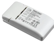
Continuous current power supply of 18W, 220/240V – 50/60Hz with 450 mA supply voltage Mains dimming, trailing edge 60.9268