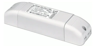
Continuous current power supply. 230/240V – 50/60Hz. Adjustable Current 350mA – 17W / 500mA – 24W / 700/ 750 mA – 32W switch by trailing and leading edge dimming, mains dimming or push dimming 60.8534