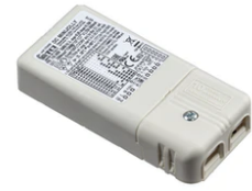
Continuous current power supply of 13-20W, 110/240V – 50/60Hz with power current selected through adjustable 300 mA – 15W / 350 mA – 18W / 400/450/500/550/600/ 650/700/750/800/850/900 mA – 15W. switch. 0/1-10V or push dimming 60.9188