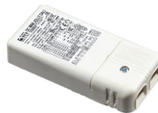
Continuous current power supply of 10-20W, 110/240V – 50/60Hz with power current selected through adjustable 250 mA – 10W / 350 mA – 15W /400 mA – 17W /450 mA – 19W /500/550/600/700 mA – 20W, Dali 1 switch. 60.8847