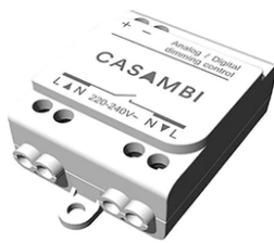
Casambi Broadcast. Remote Installation 60.9392