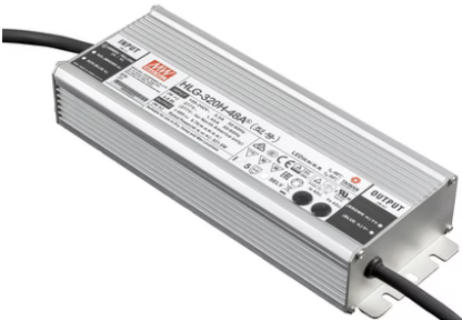
LED Power Supply Source for remote installation. 48V/320W. 100/240 Vac 60.8919