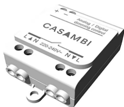
Casambi Controller 220-240V. Remote Installation 60.9392