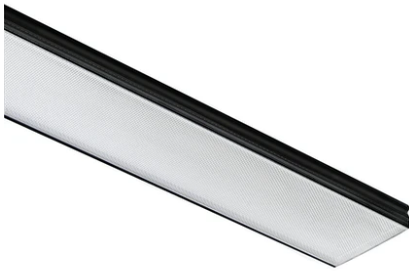
500 mm micro-prismatic diffuser. Highly efficient multilayer diffuser that, thanks to its unique microprismatic texture, provides a glare free UGR<19 light beam 08.0113.00