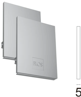
Metal cover. Suspension Up & Down. 70 mm (Colour Anodized Grey) 08.9057.02