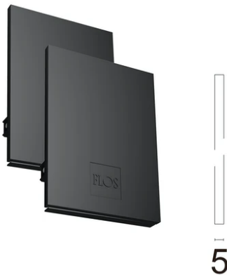
Metal cover. Suspension Up & Down. 70 mm 08.9057.06