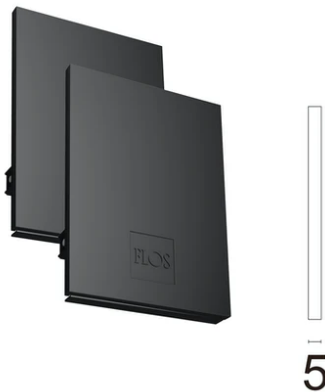
Metal cover. Suspension Up & Down. 70 mm (Colour Black) 08.9057.NS