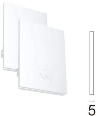
Metal cover. Suspension Up & Down. 70 mm (Colour White) 08.9057.40