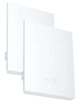
Metal cover. Suspension Up & Down. 70 mm (Colour Anodized Grey) 08.9057.02