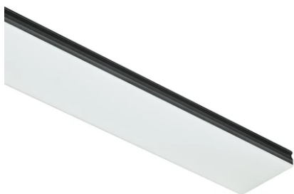
500 mm opal diffuser. Diffuse, glare free and uniform lighting throughout the room 08.0110.00