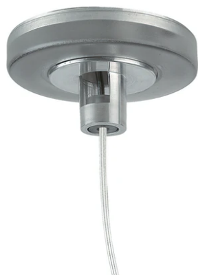
Power supply rose 08.0031.00