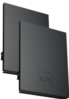
Metal cover. Suspension Up & Down. 70 mm 08.9057.06