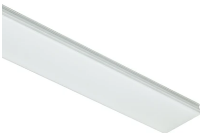
500 mm opal diffuser. Diffuse, glare free and uniform lighting throughout the room 08.0110.00