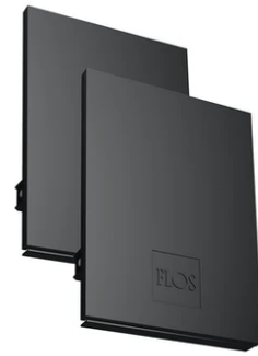
Metal cover. Suspension Up & Down. 70 mm 08.9057.06