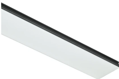
500 mm opal diffuser. Diffuse, glare free and uniform lighting throughout the room 08.0110.00