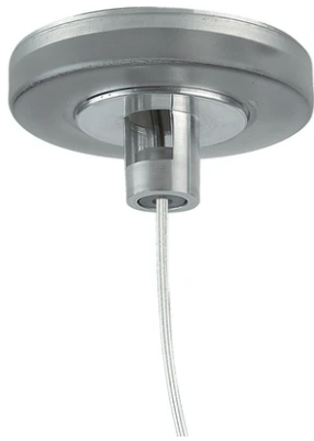
Power supply rose 08.0031.00