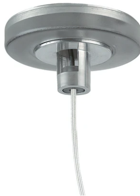
Power supply rose 08.0031.00