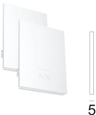
Metal cover. Suspension Up & Down. 70 mm (Colour White) 08.9057.40