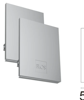
Metal cover. Suspension Up & Down. 70 mm (Colour Anodized Grey) 08.9057.02