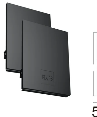
Metal cover. Suspension Up & Down. 70 mm 08.9057.06