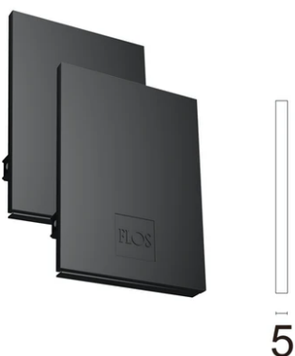
Metal cover. Suspension Up & Down. 70 mm (Colour Black) 08.9057.NS