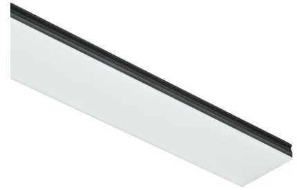
Metal cover. Suspension Up & Down. 70 mm (Colour White) 08.9057.40