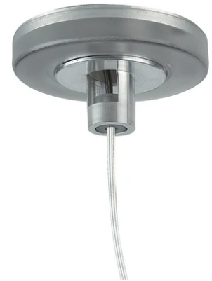
Metal cover. Suspension Up & Down. 70 mm (Colour Anodized Grey) 08.9057.02