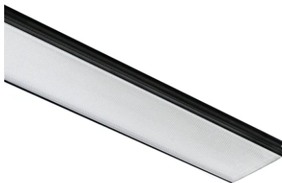
500 mm micro-prismatic diffuser. Highly efficient multilayer diffuser that, thanks to its unique microprismatic texture, provides a glare free UGR<19 light beam 08.0113.00