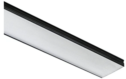
500 mm micro-prismatic diffuser. Highly efficient multilayer diffuser that, thanks to its unique microprismatic texture, provides a glare free UGR<19 light beam 08.0113.00